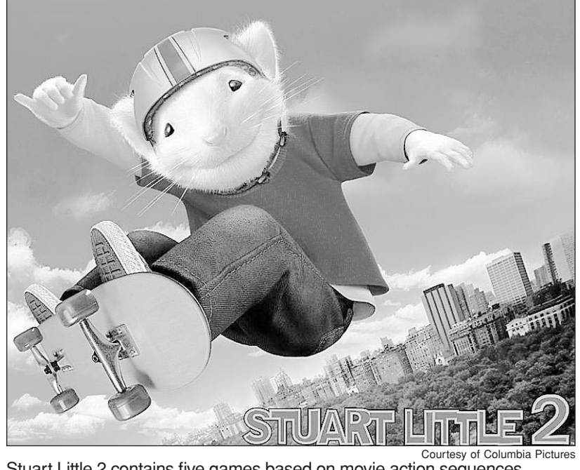
Stuart Little 2 contains five games based on movie action sequences.